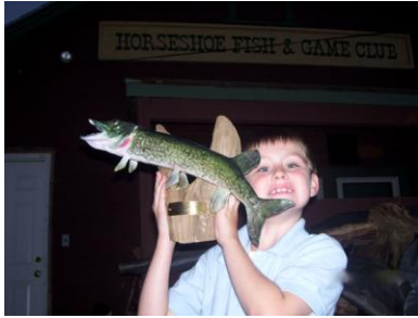
One of Our Proud Winners!

Largest Catch of the day wins a free mount!